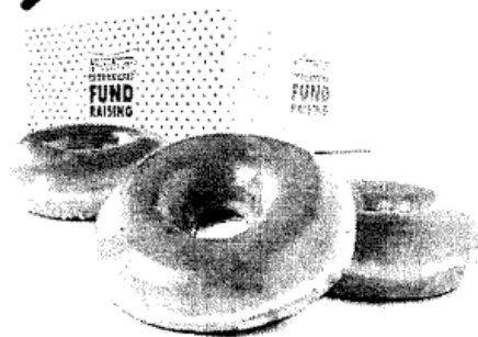
ORIGINAL GLAZED® DOZENS

Sell for $13 per box Student makes $5 per box