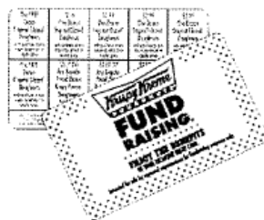
VALUE CARDS 10 ways to save, including both FREE and DISCOUNTED offers

Sell for $20 per card Student makes $5 per card